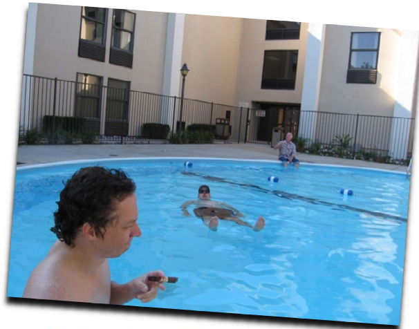
The Three Stages of Man